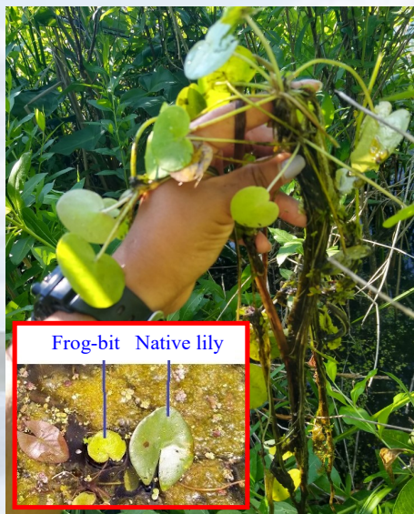
Figure 1. Picture showing European frog-bit and comparing frog-bit to native lily pads.

With summer firmly in place and summer vacations on hold, many people have increased their visits to local parks and beaches, bringing out their kayaks and going for a paddle down the Grand River! This summer, we at the JLW Cisma are asking you to keep an eye out for a new invasive species that has been found in the region, European frog-bit!