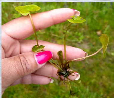
Figure 2. With shallow roots, frog-bit can be pulled out of water rather easily.

Aquatic invasive species have been introduced by people emptying aquariums into nearby lakes and rivers, accidental escape from ornamental ponds (flooding, wildlife, wind etc.) or being transferred via watercrafts and recreational gear. Naturally, they can flow from streams and rivers into lakes, with the water carrying turions, full plants and stolons. To learn more about European frog-bit or to report its presence, please contact the JLW Cisma Coordinator Dr. Shikha Singh via email ( shikha.singh@macd.org ) or by phone at (517) 432—2089. Invasive species can also be reported at www.misin.msu.com (also comes as a phone app).