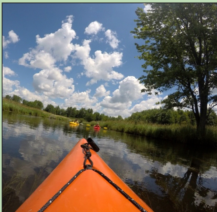
Paddling downstream on the Grand River