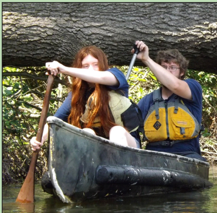
Paddling under the fallen oak trees near Hague Road