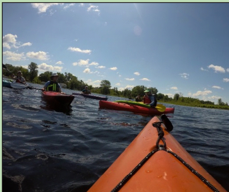
Heading across Vandercook Lake to the Grand River

four mile paddle delighted us with blooming wild flowers, dragon flies, fish, frogs, osprey, muskrats and turtles. The wind and chop of Vandercook Lake posed a slight challenge for the paddlers but was soon forgotten when we reached the Grand River. Many thanks to the Great Board members and paddlers who made the first paddle of 2020 a success.