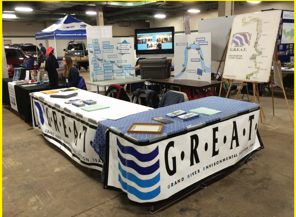
GREAT's booth at the Quiet Water Symposium.

year manned by volunteers willing to engage all who stopped by to talk about the Upper Grand River Watershed and GREAT's mission. We were strategically placed near the Middle Grand River and the Lower Grand River Organization of Watersheds. All of these groups have similar missions and interests, but each has their own unique challenges and river characteristics. While we here in the Upper Grand River Watershed have a mostly narrow river running through woods, marshes and farmland, further downstream the river is much wider and more urban in some areas. Many who stopped by to chat seemed intrigued by our differences from the Grand River they were familiar with and many want to come paddle our part of the Grand.